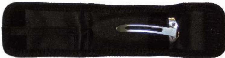
Convenient pouch included with the DA84140, DA84141.

Push thumb knob to release blade; pull blade out.