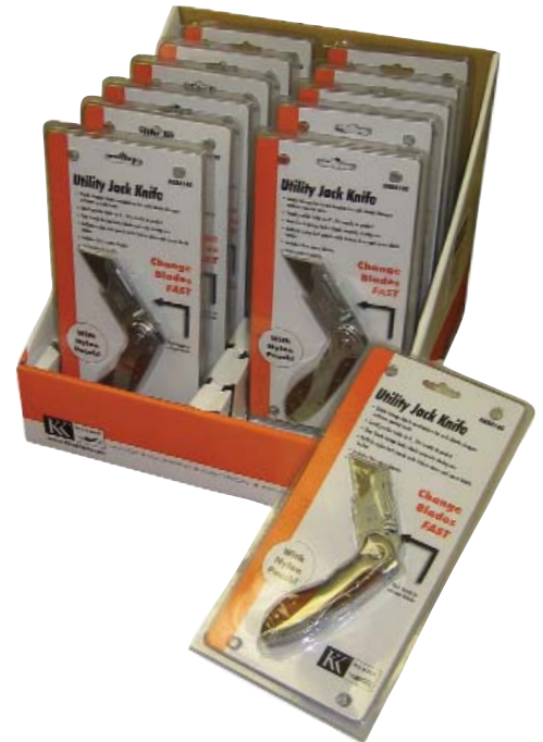
Utility Jack Knife display is 11" x 12".