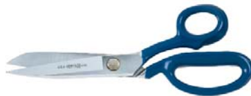
Type "B" (DC65750 shown)