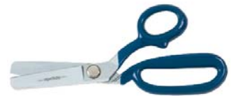
Type "C" (DC66510 shown)